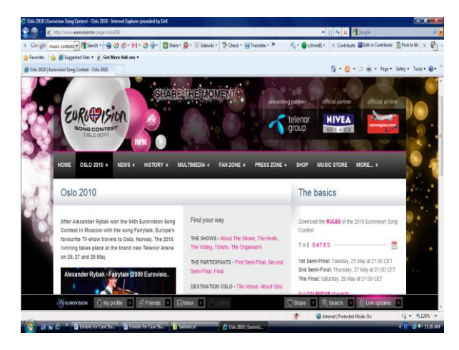
Figure 4: Music Contest Example

multiple contest categories and items, as well as creating their own voting player with custom colors, logo, and dimensions. The player could then be easily posted to a Web site or blog (see Figure 4 for an example of a music contest). In addition to seeking out big partners with a national footprint, Procyon realized that preference mapping efforts