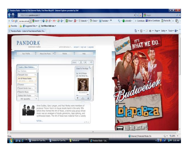
Figure 2: Pandora Web Site Showing a Smart Playlist

services, healthcare, etc.) with the right additional data sources.