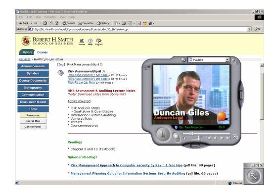
Figure 3: Sample Online Environment

group discussion boards, identity spoofing using anonymous postings, use of cookies to maintain state, and authentication with university's directory services for single sign-on to the portal. Follow-up discussions resulted in identifying factors to be considered when designing secure intranets for corporations.