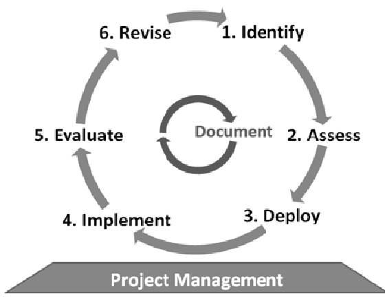
Figure 3: A Replicable Experiential Learning Cycle for Information Technology Students

The cycle repeats as students and instructor in the current or successive semesters identify newly emerging technology areas ("Identify" step), such as Mobile-Commerce, Location Aware Services, and other still-maturing technologies. Given the rapid pace of change in hosted services, knowledge will naturally evolve over successive semesters as service providers improve their offerings.