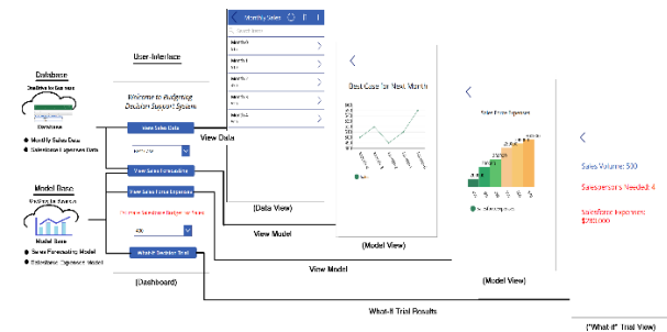
Figure 2. DSS Design Diagram of the Example of Salesforce Budgeting

Excel table to view the non-linear relationship between sales and salesforce expenses which include salespersons’ salaries and overhead expenses. They are able to leap across the display screens to reach their decision based on their judgement on the current situation. They can input trial data of estimated sales using dropdown menus, and perform a “what-if” analysis to come up with a “satisfactory” estimated salesforce expense for the budgeting. In the construction aspect, the example introduces basic elements of the user-interface, such as Screen, Label, Text, Button, Chart, Dropdown, and others. It demonstrates the use of parameters for these objects. Figure 2 is a DSS design diagram that depicts the design of the DSS example of salesforce expenses budgeting.