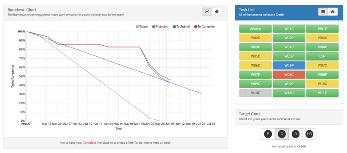
Figure 2. Student's Dashboard in Doubtfire

Credit will be shown Pass and Credit level tasks (as depicted in Figure 2). For control purposes, all students must complete two closed-book tests to ensure their understanding of important programming concepts.