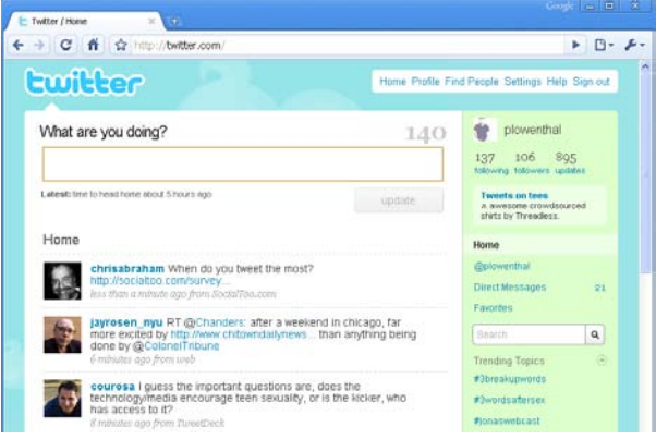
Figure 1. Twitter Website

In 140 characters or less, people share ideas and resources, ask and answer questions, and collaborate on problems of practice; in a recent study, researchers found that the main communication intentions of people participating in Twitter could be categorized as daily chatter, conversations, sharing resources/URLs, and reporting news (Java et al., 2007). Twitter community members post their contributions via the Twitter website (see Figure 1), mobile phone, email, and instant messaging-making Twitter a powerful, convenient, community-controlled microsharing environment (Drapeau, 2009). Depending on whom you choose to follow (i.e., communicate with) and who chooses to follow you, Twitter can be effectively used for professional and social networking (Drapeau, 2009; Thompson, 2007) because it can connect people with like interests (Lucky, 2009). And all of this communication happens in real-time, so the exchange of information is immediate (Parry, 2008a; Young, 2008).