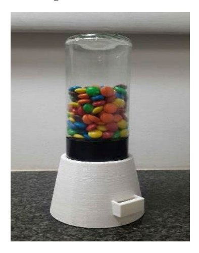
Figure 2. Candy Dispenser 6. FEEDBACK

Since the start of the course, we asked for feedback on the different parts of the course. The feedback is mainly of a qualitative nature. A total of 292 students completed the questionnaire over the three years from 2016-2018. Ethics approval for collecting and disseminating student data was obtained from the university. Informed consent was received from the students who participated.