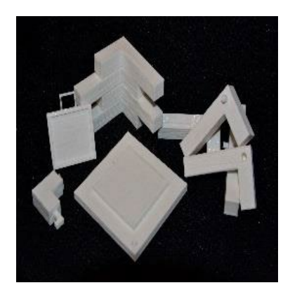
Figure 1. Pencil Holder

The students can only complete the assignment by sourcing additional knowledge, and they are free to use any means to do so, including the internet and asking friends or family. In this way, students are prepared for the world of work where one is not given a recipe for completing a task. Further, the openended nature of this project serves as an enrichment opportunity for exceptional students.